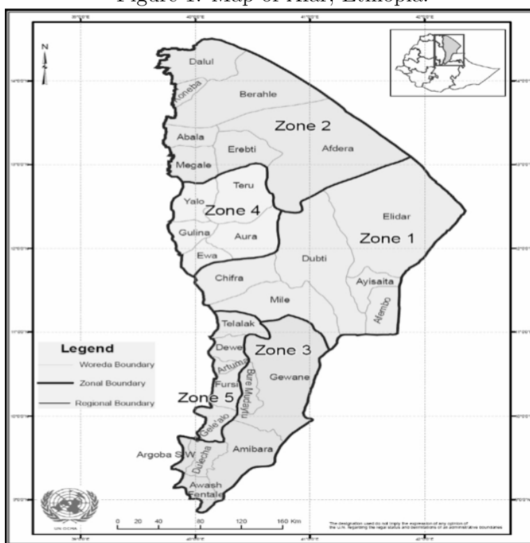
Figure 1: Map of Afar, Ethiopia.

Note: This map shows the Afar region in Ethiopia (UN OCHA, http://www.unocha.org ).